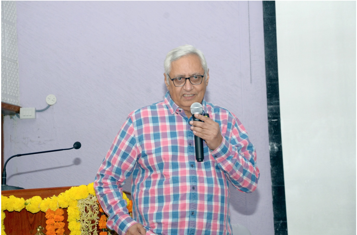
A Technical session in progress