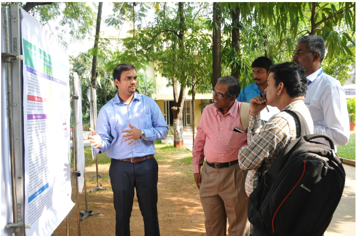
Poster sessions in progress