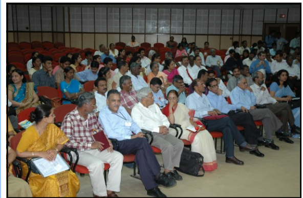
Distinguish Delegates of Sixth Conference

and it is suggested that proper counseling is necessary about the complications of Anemia and Iron rich foods to the rural adolescent girls to improve their health status.