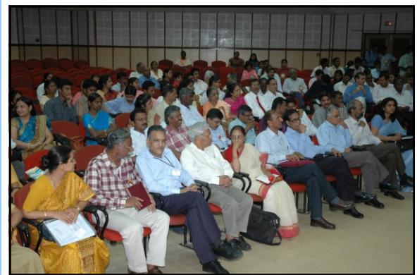
Distinguish Delegates of Sixth Conference

and it is suggested that proper counseling is necessary about the complications of Anemia and Iron rich foods to the rural adolescent girls to improve their health status.