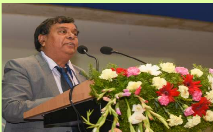
Dr. J.K. Banthia, former Registrar General and Census Commissioner of India, delivering the inaugural address of the IASSH annual conference