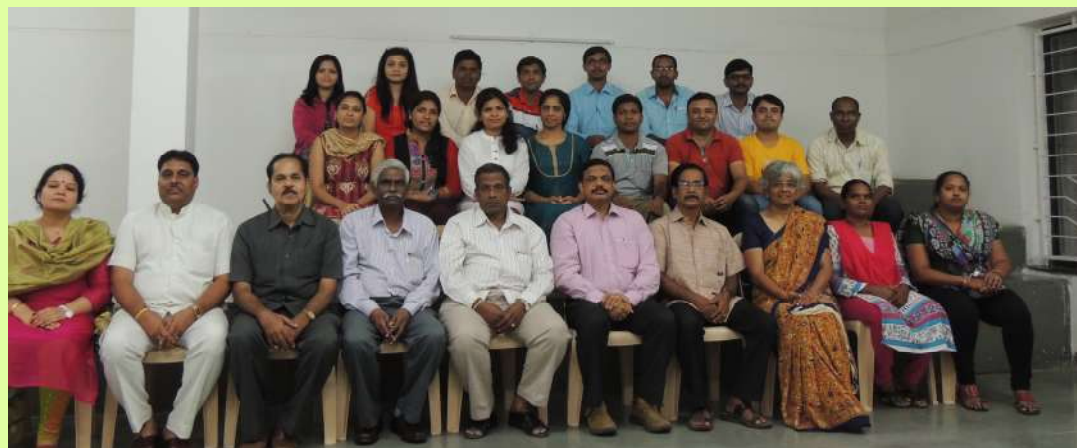
Participants of the Pre-conference Workshop with organizers and resource persons