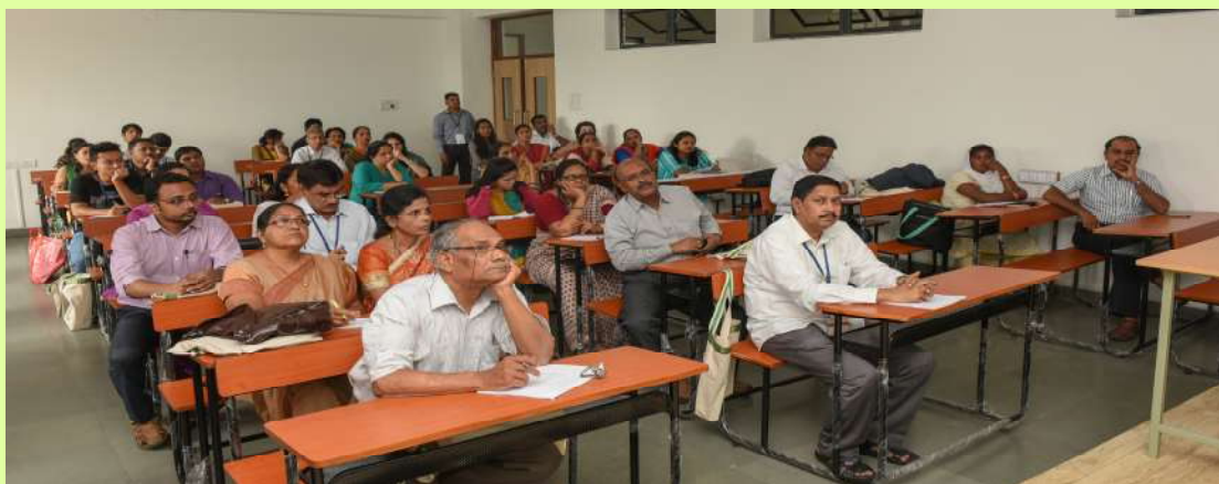
Technical Sessions in Progress

Specific to 14 th IASSH Annual Conference, we are happy to note that the response to 'call for abstracts' was overwhelming for all the 3 categories of oral, poster and youth best paper award presentations and across the 24 sub themes provided under the main theme: "Health, Gender and Development: Emerging Issues and Challenges". We received almost 450 abstracts out of which a screening committee reviewed and selected 200 abstracts. Overall, 300 delegates have participated at the conference across the 3 days. In all, 120 presentations were made as part of the 14 technical sessions held on Day 1 & 2. About 45 posters were displayed and presented by the respective authors. Around 28 Youth Best Paper Presentations were done in the conference which was evaluated by expert committees.