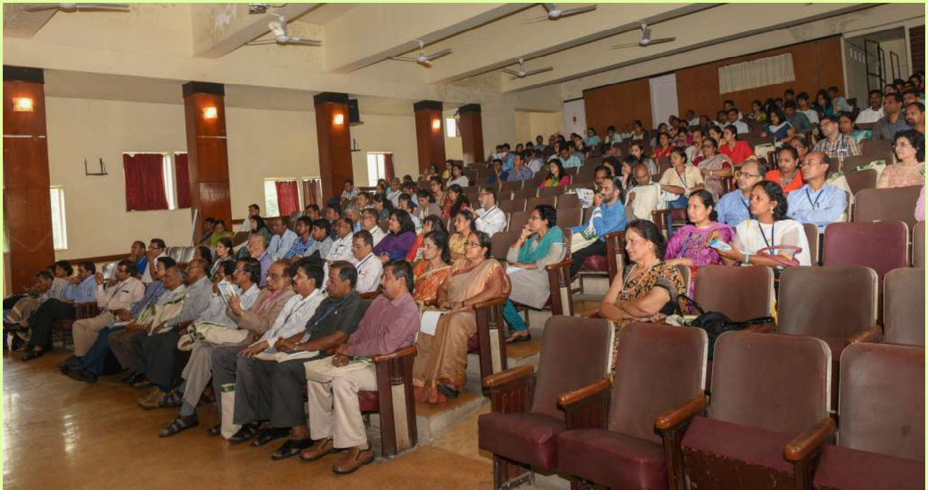
Participants at the Inaugural session