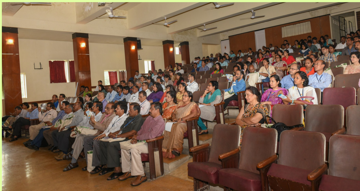
View of the Conference Participants at the Gokhale Institute of Politics and Economics, Pune.