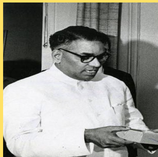
The late Dr. S. Chandrasekhar

KARMIC TIES BIND INDIA WITH THE UNITED STATES: AN AMERICAN STUDENT CUM UNIVERSITY HELP US REMEMBER THE CONTRIBUTIONS MADE BY DR. S. CHANDRASEKHAR, DEMOGRAPHER AND FORMER UNION MINISTER OF HEALTH & FAMILY PLANNING, GOVERNMENT OF INDIA.