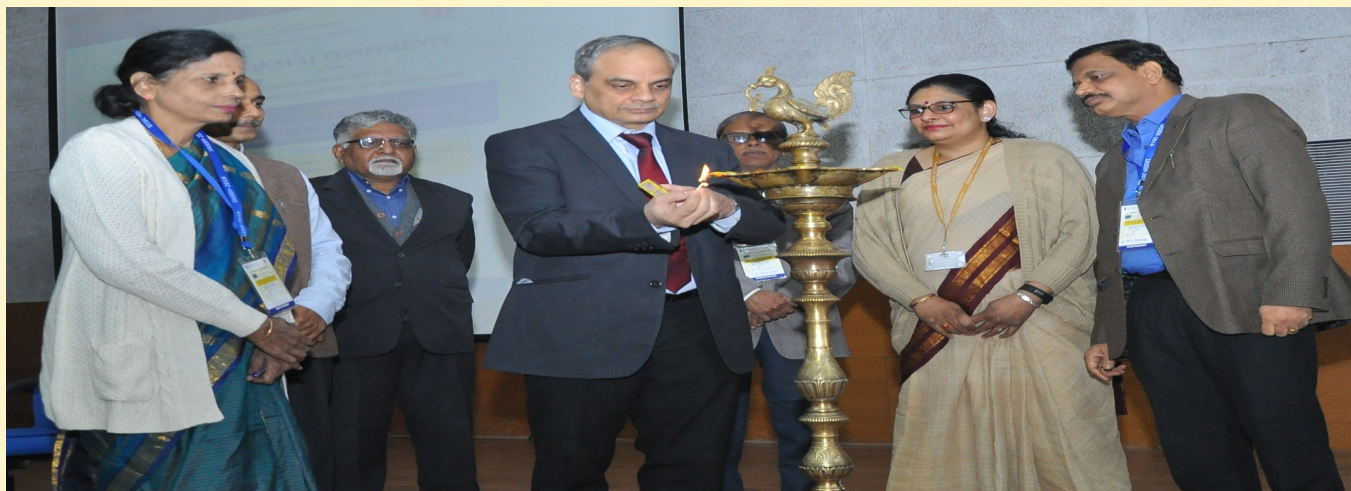
Lighting of the Lamp by the Chief Guest