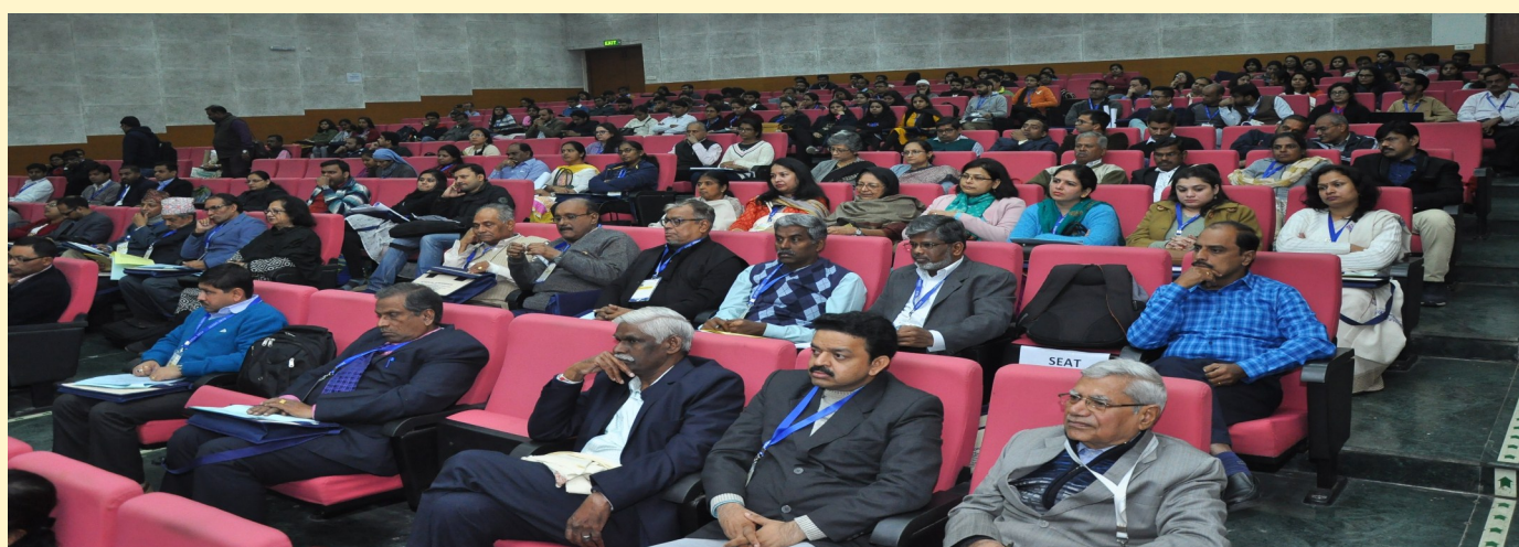
View of the Audience at Inaugural Function