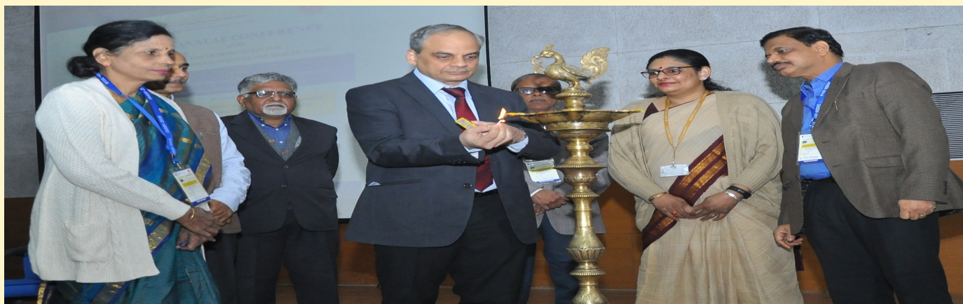
Lighting of the Lamp by the Chief Guest