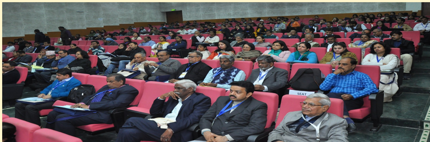
View of the Audience at Inaugural Function