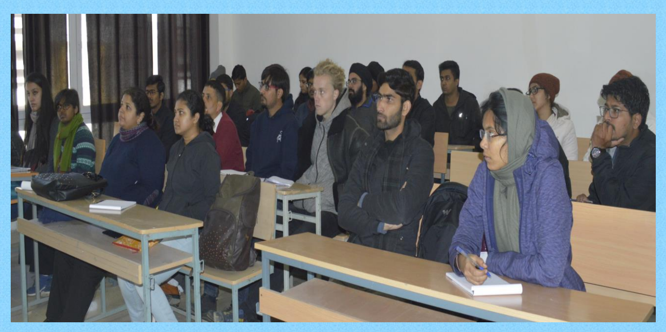
Workshop session in progress