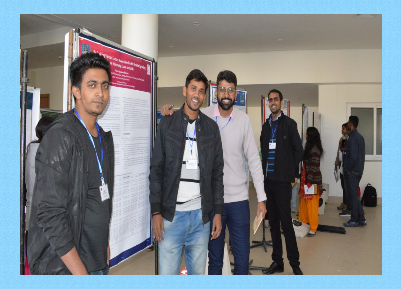
Poster Sessions in Progress