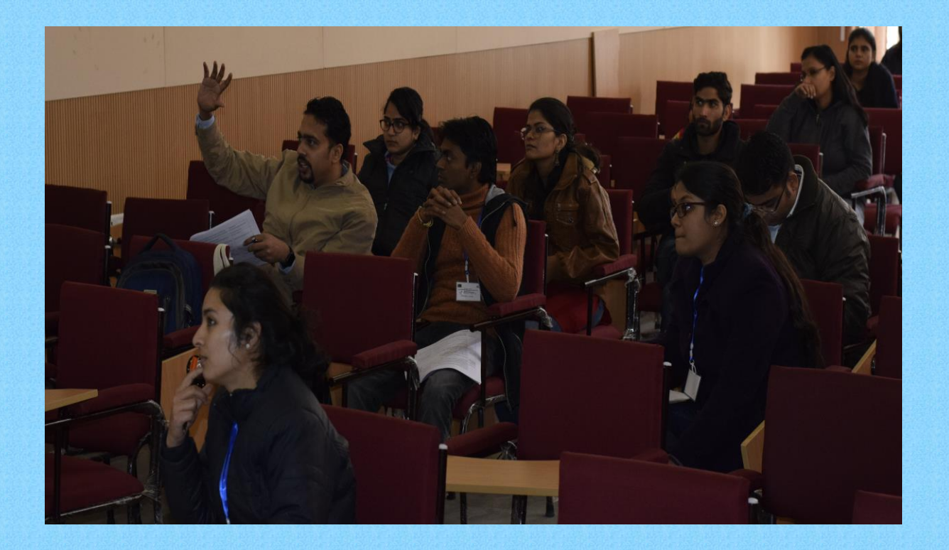
Technical Sessions in Progress