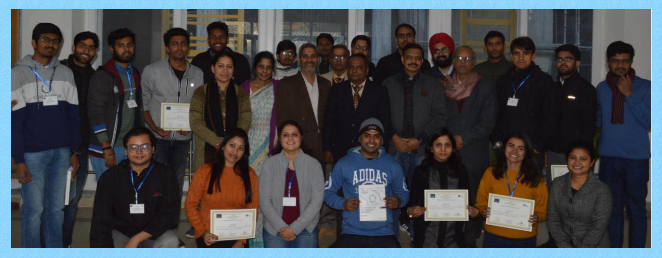
Workshop participants with resource persons

The pre-conference workshop was held during 5th to 7th December, 2019 at School of Humanities and Social Sciences (SHSS), IITM. In order to train the young research scholars, IASSH has initiated the Pre-Conference Workshop from the year 2010 onwards. Important aspects of advanced research methods were discussed in this year's workshop and the experts provided guidance to the M.Phil./ Ph.D scholars in analyzing and executing their study. This year 30 research scholars from various universities and institutes across India have participated in the workshop and they gave the feedback that this is a useful training for them in fine-tuning their research skills for preparing their dissertations. The participants were given certificates and a newly published book on 'Qualitative Research Methods' (Sage Publications) which was donated by the Sigma Research and Consulting Ltd, New Delhi.