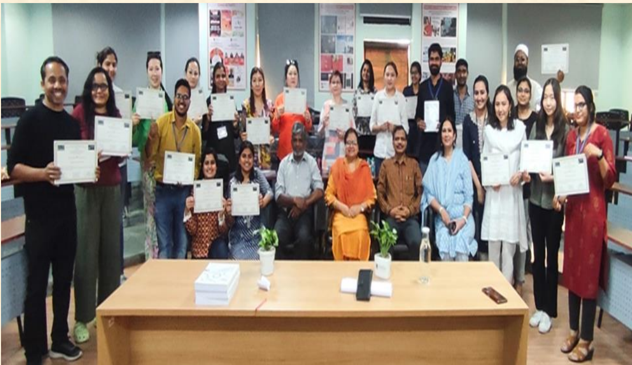
Workshop participants with the Workshop Coordinators.

Topics Covered in the Workshop: Introduction to Qualitative Research, Selection of Research Problem, Approaches in Qualitative Research, Strength and Limitations of Qualitative Research, Methods of Collection of Qualitative Data, Development of Tools, Data Analysis using Atlas-ti.