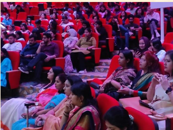
Participants attending the Inaugural Session.