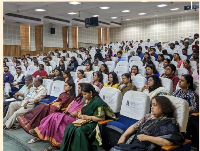
Participants attending the valedictory Session at the Dr. APJ Abdul Kalam auditorium