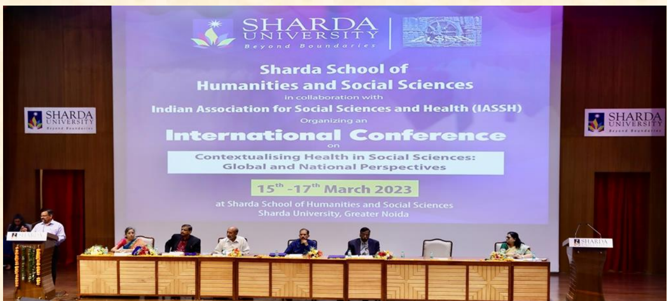
Opening Day of the IASSH Conference 2023 at the Anand Swaroop Auditorium of Sharda University.