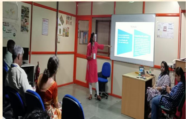
Technical sessions are in progress.