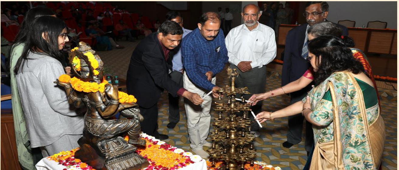
Lighting of lamp by dignitaries at the Inaugural Session.