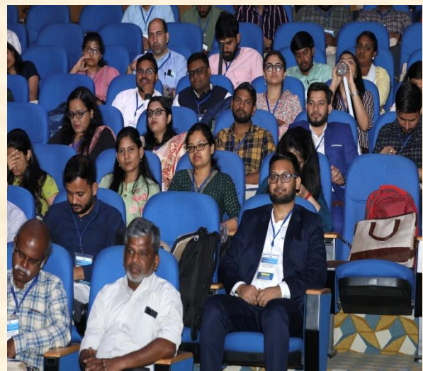
Participants attending the Prof. K. E. Vaidyanathan Memorial Lecture