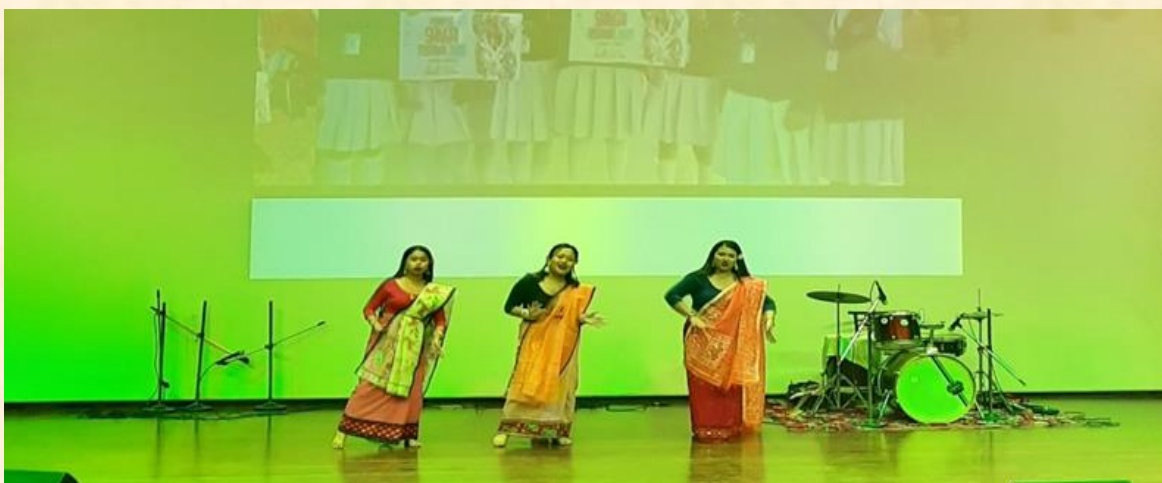
Classical Dance by students of Sharda University.