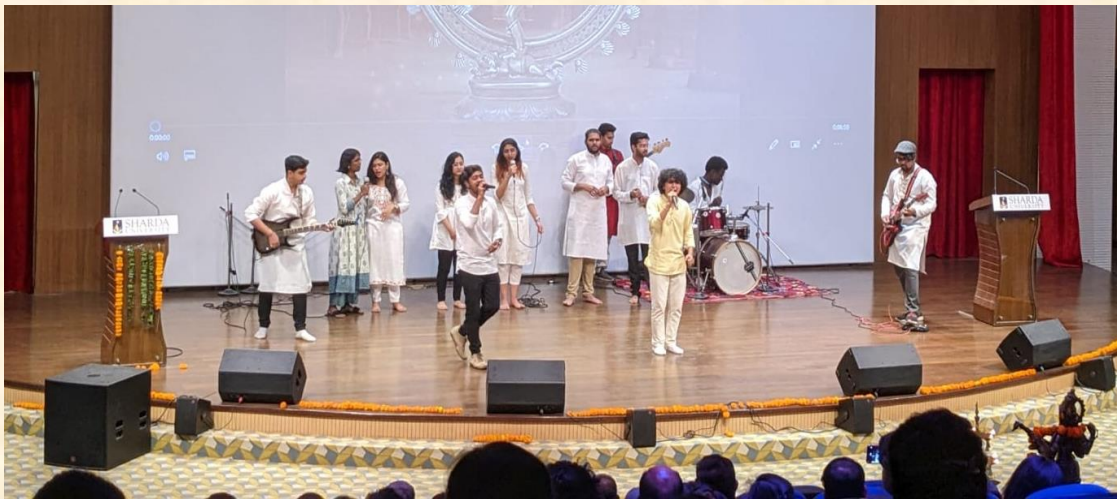
Musical performance by students of Sharda University.

In addition to the dances, there were also several musical performances that included both classical and modern songs. The singers, accompanied by talented musicians, mesmerized the audience with their melodious voices and soulful renditions. The event was a testament to the fact that cultural programs like these are a great way to promote and preserve our cultural heritage. The event was well-attended and was appreciated by all participants.