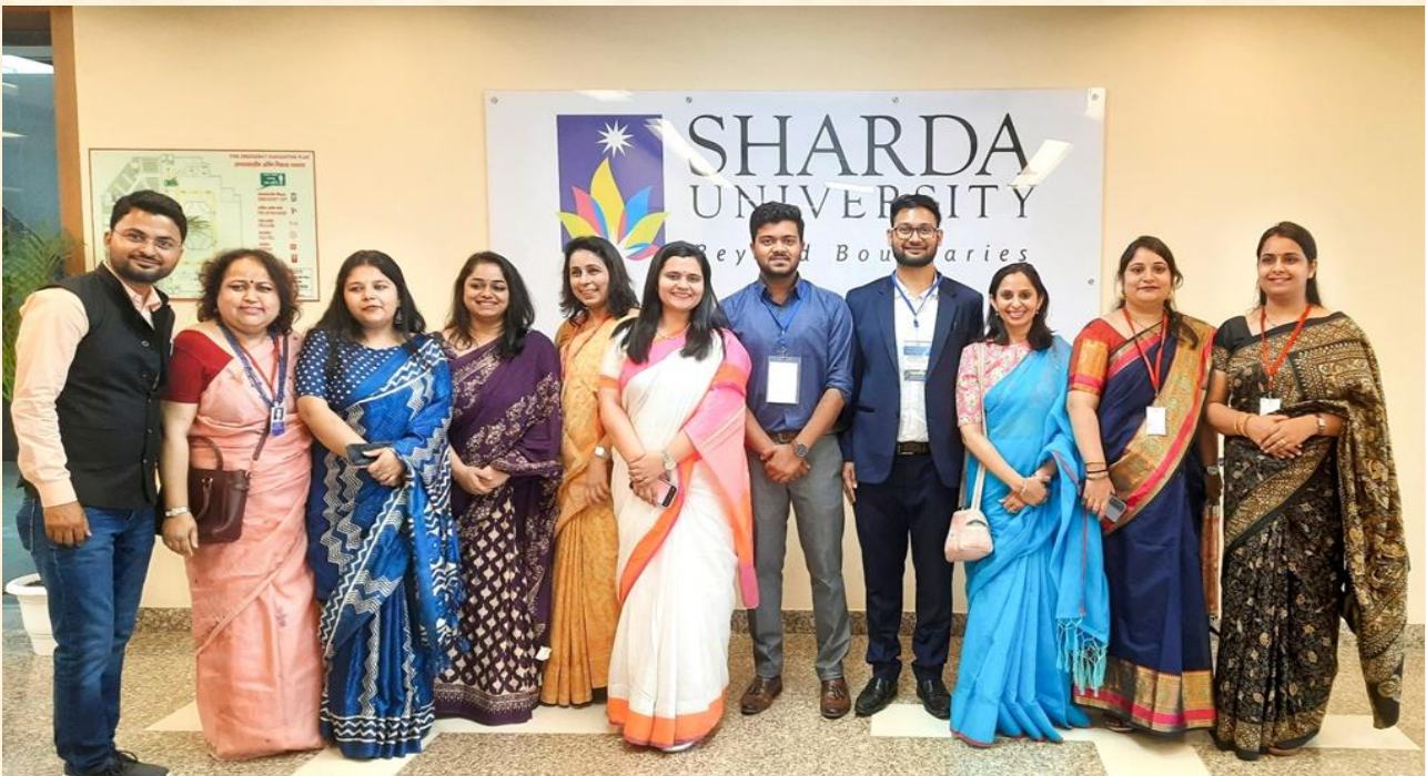
IASSH volunteers with local organizing team of Sharda University.