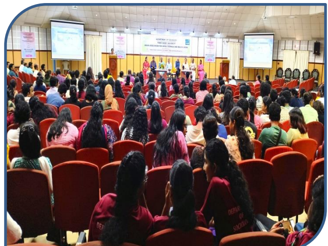
Participants attending the valedictory Session at the J N Auditorium