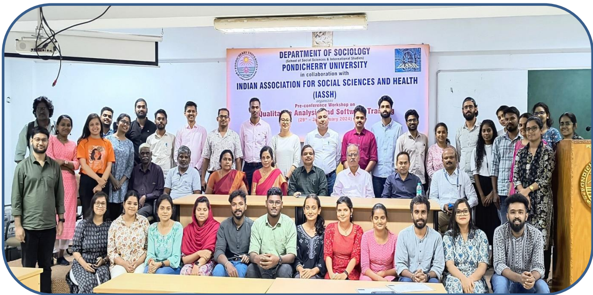
Workshop Participants with the Resource Persons and Workshop Coordinators.