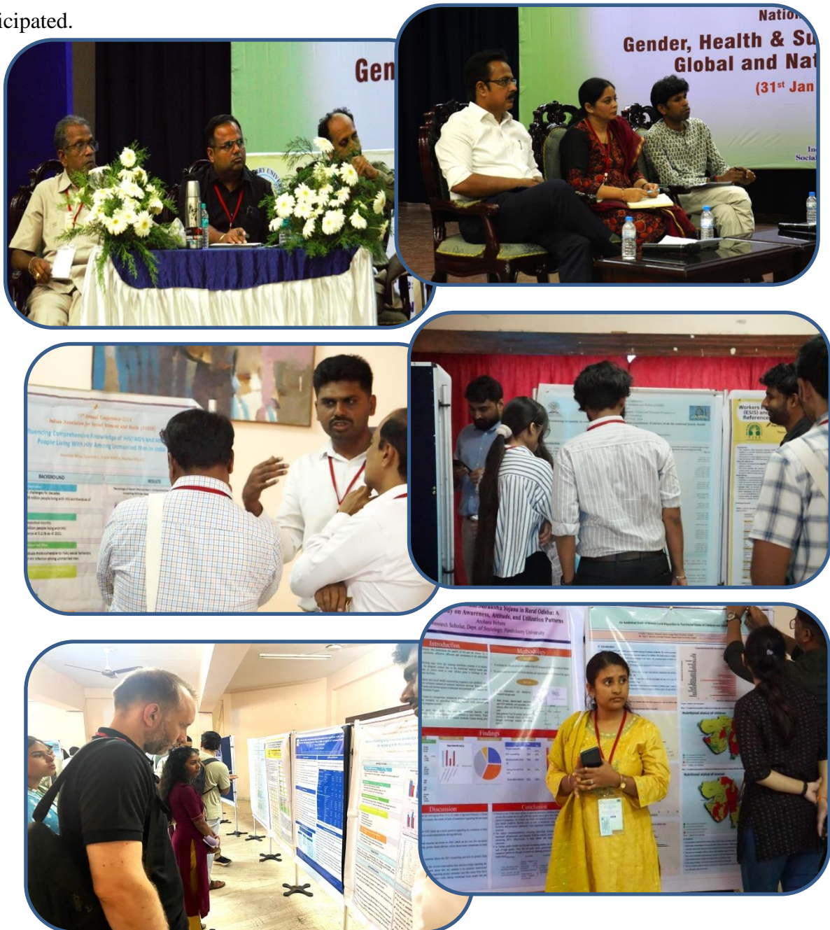
Technical and Poster Sessions are in Progress.

We are happy to report that IASSH received an overwhelming response to our call for abstracts in all three categories – Oral, Poster, and Youth Best Paper Award competition . A committee selected the abstracts for the conference. Seventeen technical sessions were held, in which researchers presented 94 papers. Forty poster presentations were made in two sessions on the 31 st of January and the 1 st of February. The Best Youth Paper award competition was conducted on the 1 st of February, in which 22 young researchers participated.