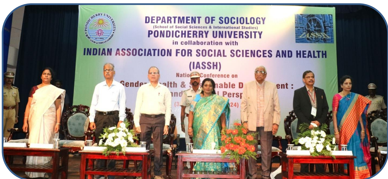
Inaugural Session of the IASSH Conference 2024 at Pondicherry University