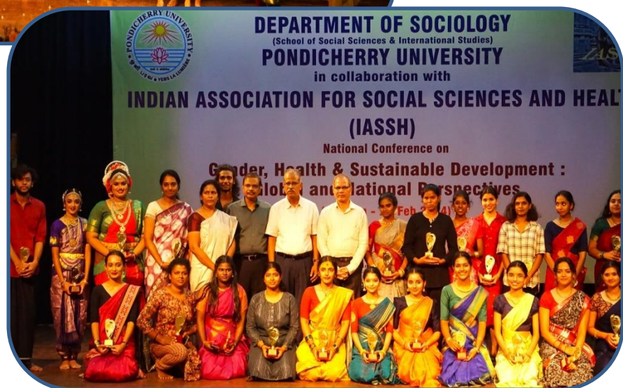
Facilitation of artist by conference organizers