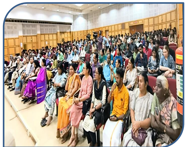
Participants attending the Inaugural Session.