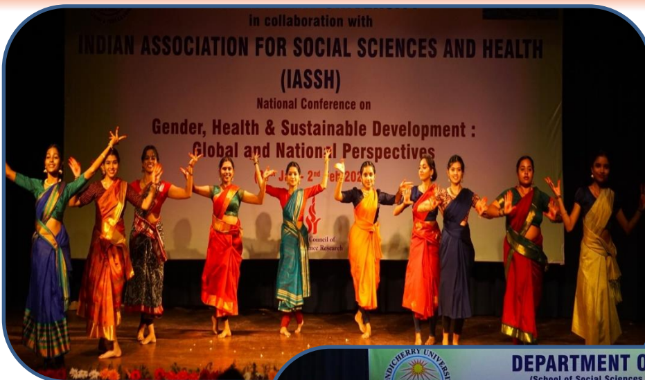
Musical performance by students of Pondicherry University