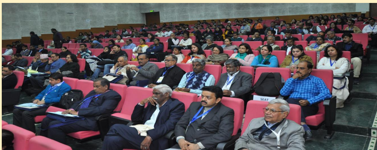
View of the Audience at Inaugural Function