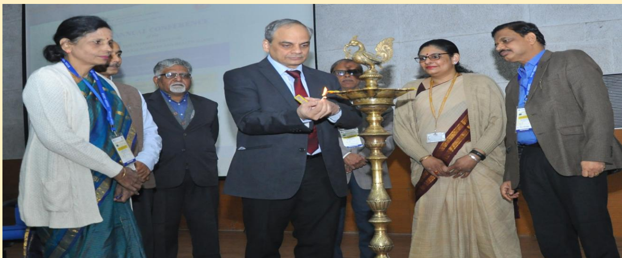
Lighting of the Lamp by the Chief Guest