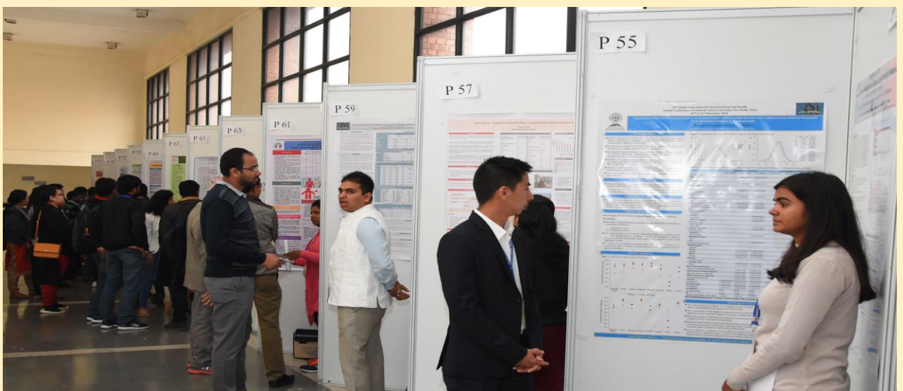
Poster Sessions in Progress