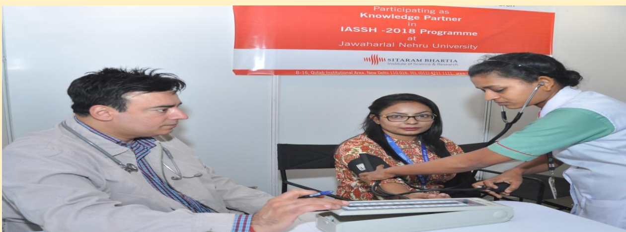
Health Check-up Camp by Sitaram Bhartia Institute of Science & Research

The pre-conference workshop was held during 7th to 9th December, 2018 at CSRD, Jawaharlal Nehru University. In order to train young research scholars, IASSH has initiated the Pre-Conference Workshop from the year 2010 onwards. Important aspects of advanced methods were discussed in this year's workshop and the experts provided guidance to the M.Phil/ Ph.D scholars in analyzing the datasets and executing their study. This year, 59 research scholars from various universities and institutes across India have participated in the workshop. The participants felt that this is a useful training in fine-tuning the data analytical skills for their dissertations. The participants were given certificates and a newly published book on sampling methods.