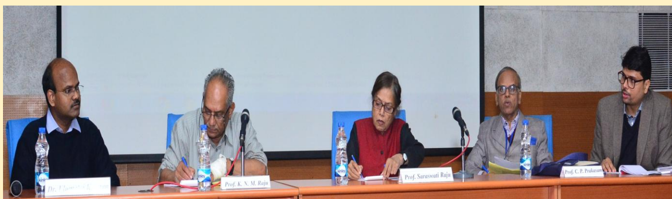
Technical Sessions in Progress

Specific to 16 th IASSH Annual Conference, we are happy to note that the response to ‘call for abstracts’ was overwhelming for all the 3 categories of oral, poster and youth best paper award competition and across the 28 sub themes provided under the main theme: "Health, Well-Being and Regional Development: Emerging Issues and Challenges". We received more than 500 abstracts out of which a screening committee reviewed and selected 250 abstracts for conference presentations. Overall, 300 delegates have participated in the conference across the three days. In all, 120 oral presentations were made as part of the 15 technical sessions held on Day 1 & 2. About 110 posters were displayed and presented by the respective authors. Around 22 Youth Best Paper Presentations were done on the third day of the conference which was evaluated by expert committees.