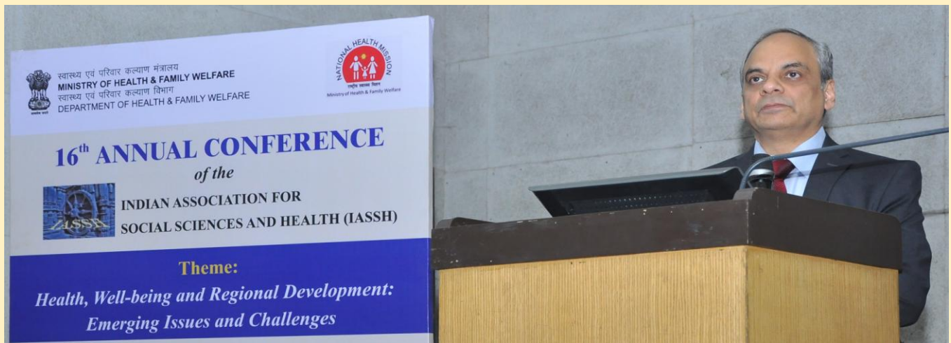
Inaugural Address by Shri. Pravin Srivastava, Secretary and Chief Statistician of India, Ministry of Statistics and Programme Implementation, Govt. of India