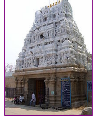
KodhandaRamaSwamy Temple at Tirupathi

To enhance the research skills among the scholars, IASSH introduced pre conference workshop on "Approaches to Social Science Research" during 8-10 February, 2011. The contents of