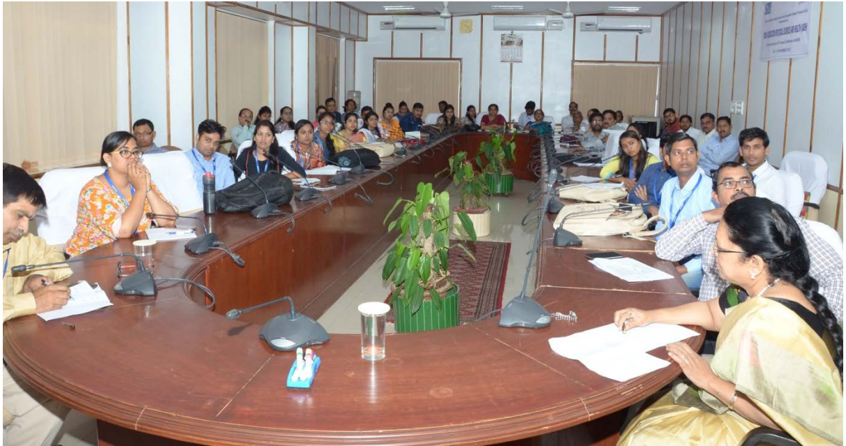
Technical Sessions in Progress