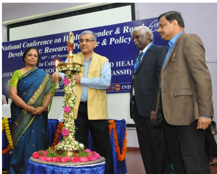
Inauguration of the conference by lighting the lamp