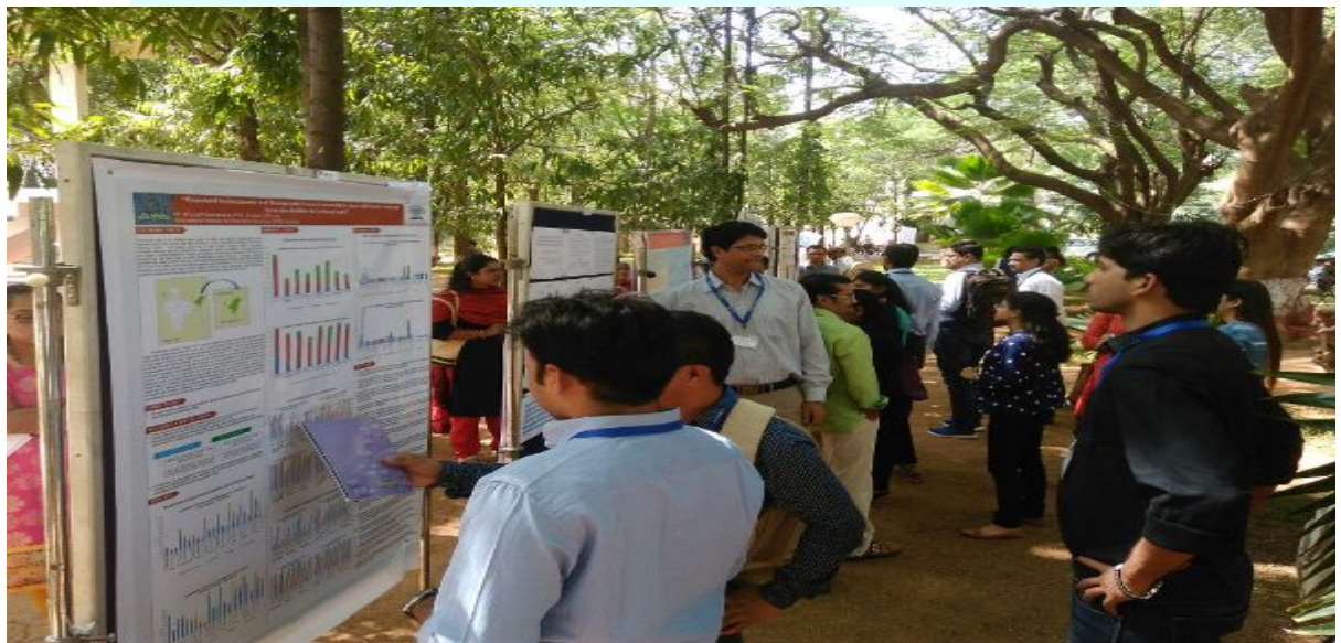
Poster Sessions in Progress