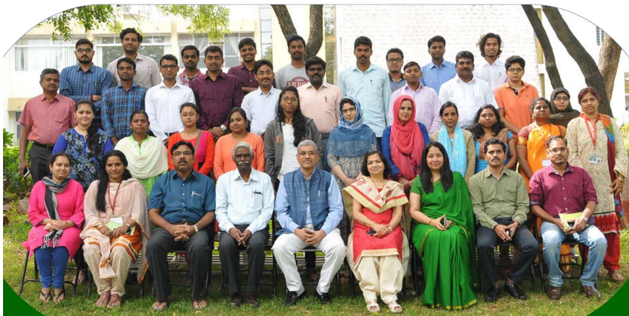
Participants of the Pre-conference Workshop with organizers