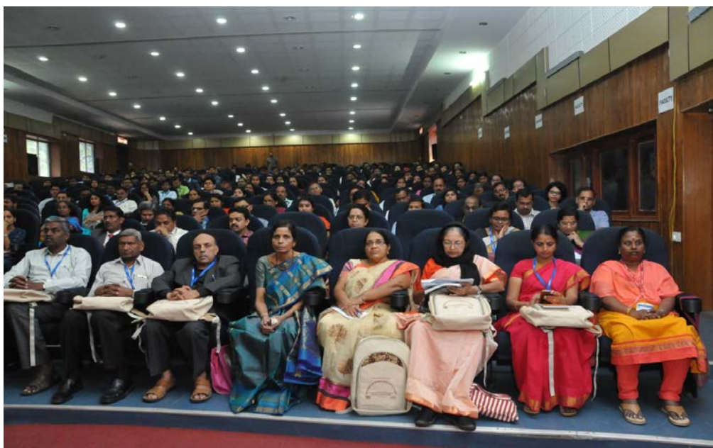
Participants at the Inaugural session