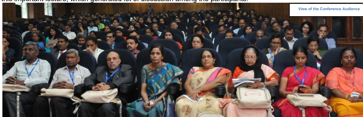
View of the Conference Audience